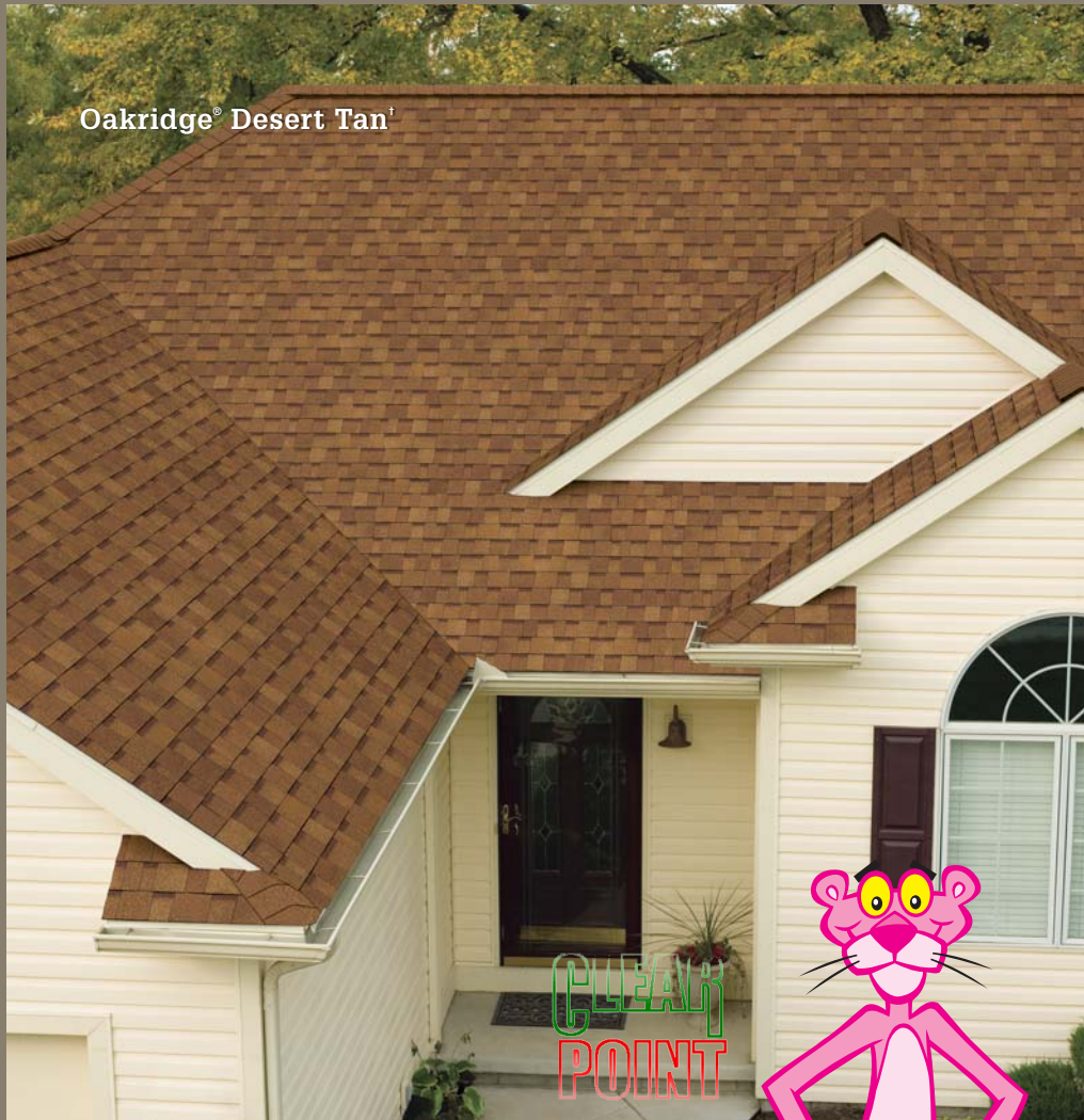
Oakridge® Desert Tan 1